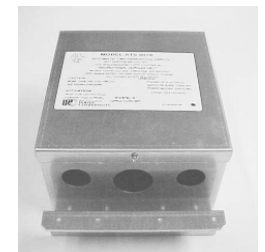
ATS 5070 MB (Mounting Bracket)