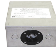
ATS 5070 FI (Flanged Inlet)