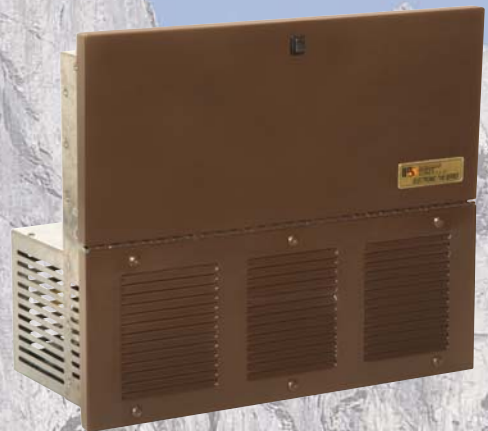
Output amperages: 45 amps and 55 amps of filtered DC power.