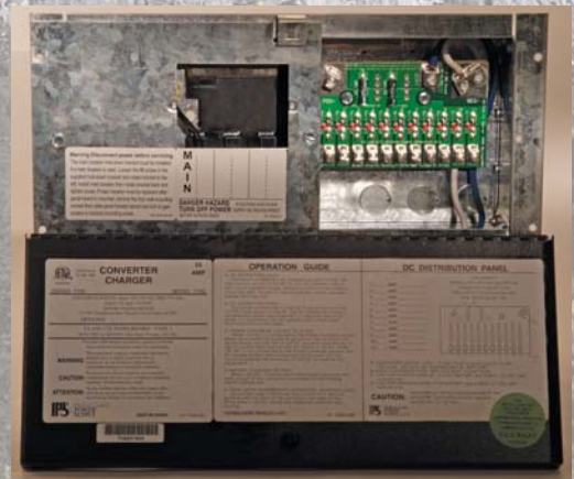
Distribution panel accommodates a 30 amp main AC circuit breaker, five AC branch circuits, and 11 DC fuse circuits (circuit breakers and fuses not provided). Reverse polarity and battery fuses are provided.